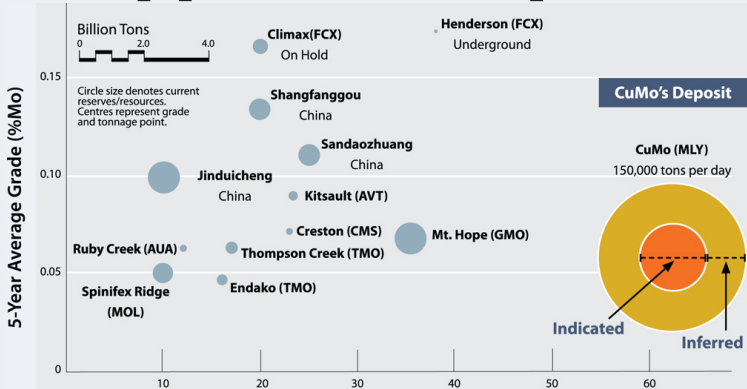
Average Yearly Production for a 5-Year Period (Million lbs Mo)

"At American CuMo Mining, we look for value in low-cost projects operating in stable jurisdictions ensuring our investment is safe and backed by solid assets"